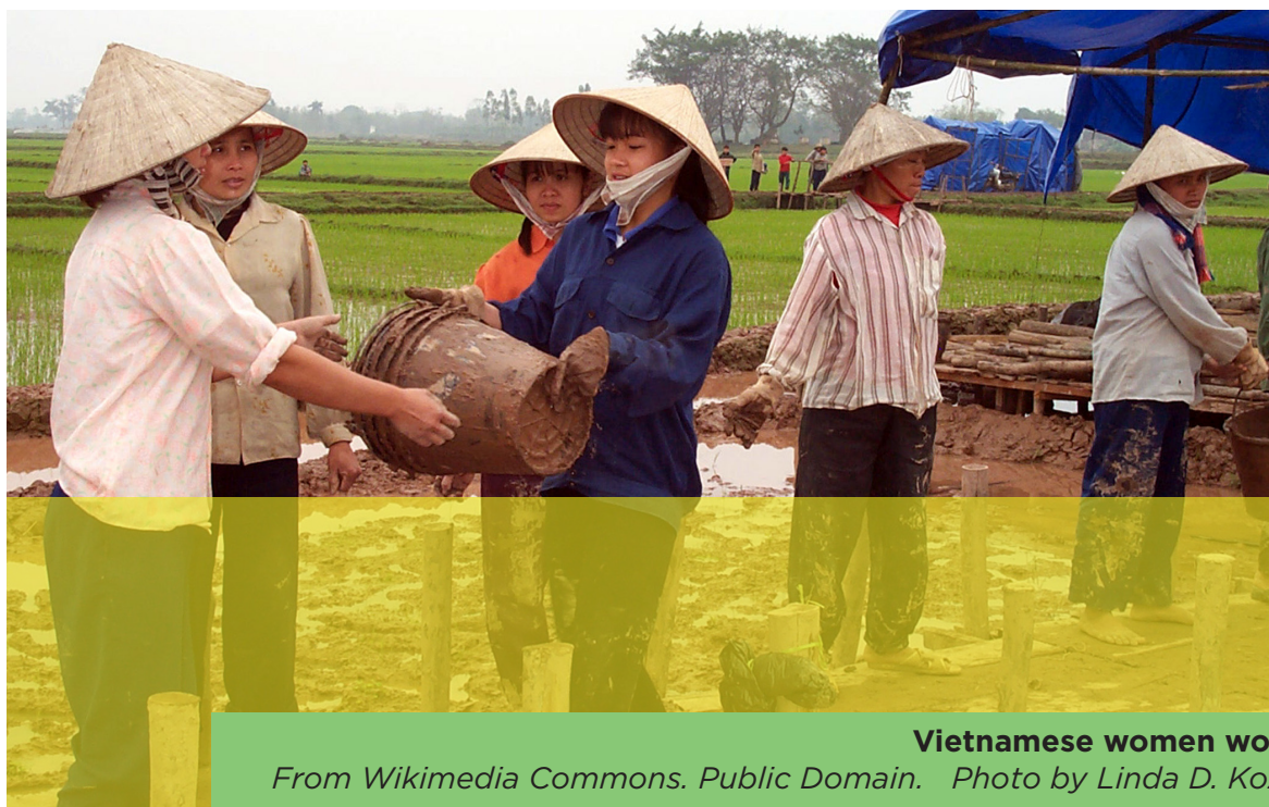
Vietnamese women working.

Although the day was organized by the Center for Women in Public Administration and Politics (WiPPA), a newly established center within the Academy, I was aware that I had to be careful about how I spoke. So when I started the day by discussing the feminist economics critique of neoclassical economics, to which most of the attendees had some exposure, I didn't use the "f" word and instead used the UN code-word "gender-responsive economics". We discussed the economic characteristics of unpaid care work, which was grounded in my 20 years of experience living in and working on Vietnam. When I asked for questions from the floor, people's freedom to speak their minds meant that many of the old stereotypes that persisted through central planning and renovation reared their head: that the Vietnamese gender division of labor was cultural and that people did not want their culture to change; that Vietnamese households shared their incomes and assets; that women enjoyed and preferred unpaid care work; and that the policy implications of recognizing unpaid care work were not self-evident.