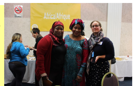
Partying at the NGO CSW Reception

Quote Geena Davis: "There are profoundly fewer female characters in movies and television programs aimed specifically at young children. And a tremendous amount of hyper sexualisation and stereotyping of the female characters in these entertainments that were made for kids."