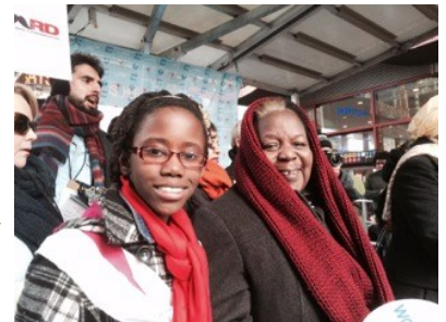
The youngest and the oldest

Under the slogan of Planet 50—50 by 2030 STEP IT UP , and on the occasion of International Women's Day , March 8, UN Women and the City of New York organised a march going from Dag Hammarskjold Plaza to Times Square. Thousands of women participated.