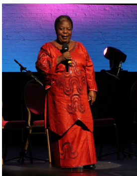
Dr. Gertrude Mongella speaking on Consultation Day