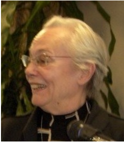
'Forging the International We'