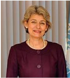
Irina Bokova UNESCO