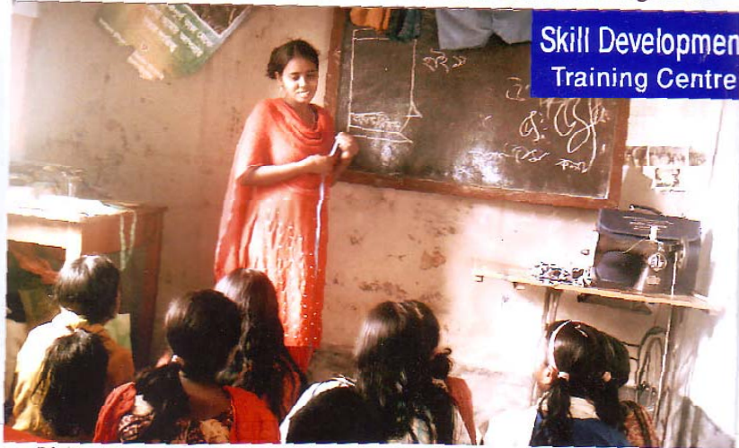
Girls are learning from POWER's trainer how to measure clothes by tapes for undertaking tailoring as a micro-trade

on Project for Eradication of Hazardous Child Labour in Bangladesh