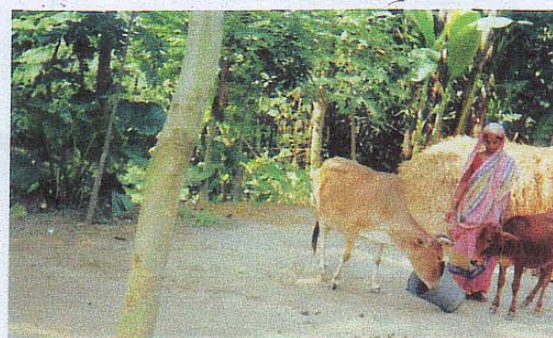
After getting training and capital, a woman beneficiary is busy with cattle-raising