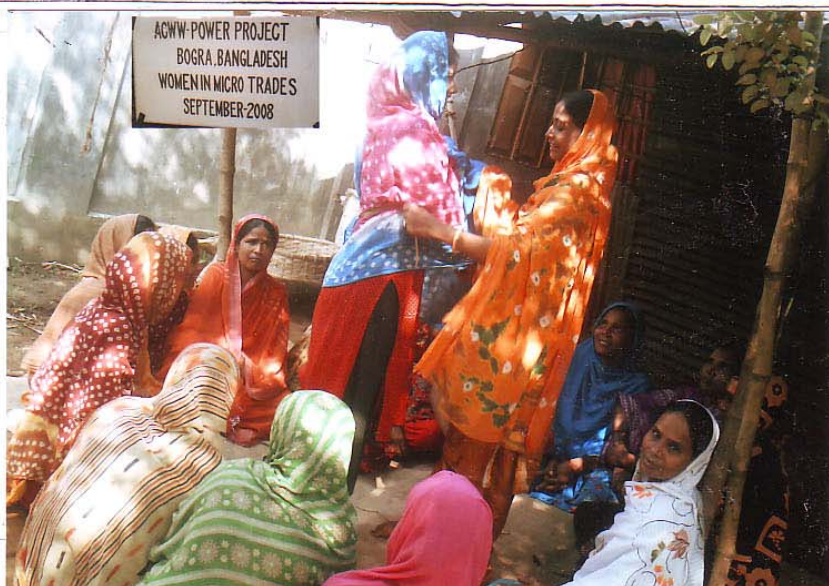
The master-tailor of POWER of Bogra is teaching the slum-women the know-how of measuring clothes by tape/lace for tailoring purpose.