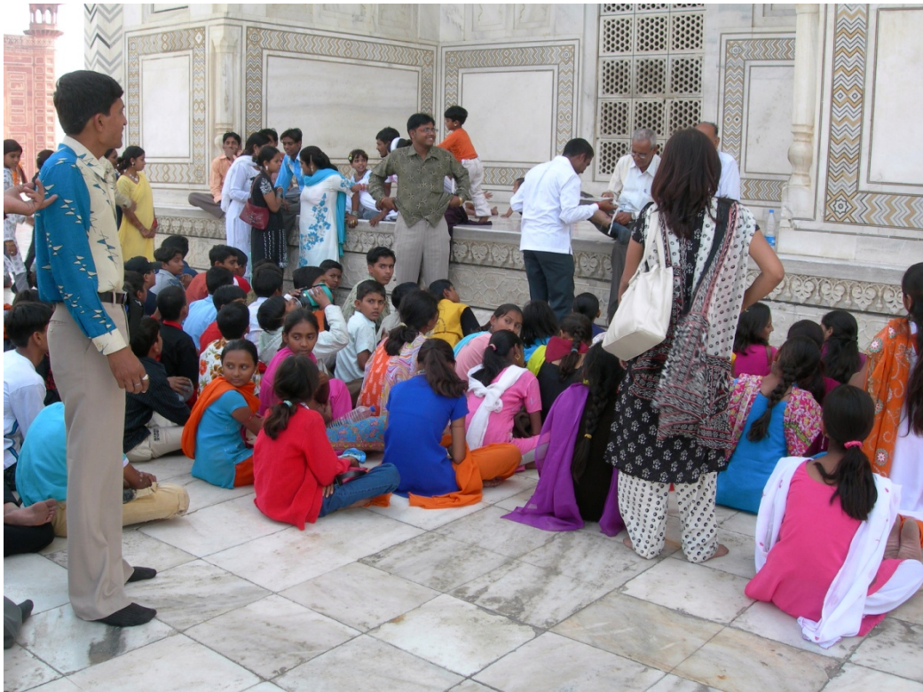
Indian school children visiting Taj Mahal