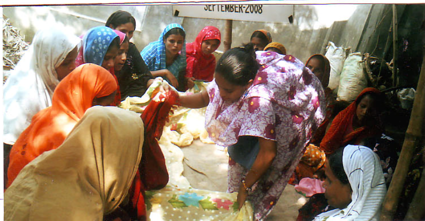
Slum-women are learning from POWER's trainer the method of setting 'chumki' (spangle) on sarees (women's garment) in the NFE centre