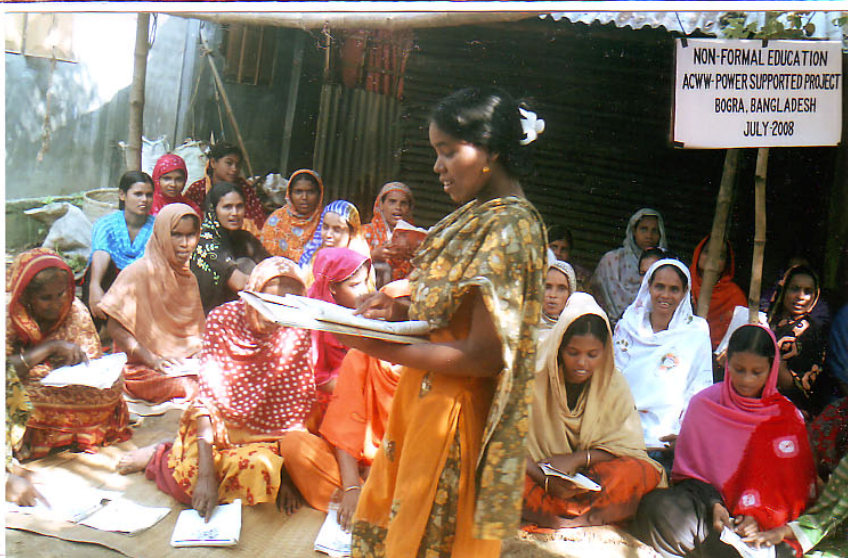
At Chapra-para of Bogra town slum-centre, the educant slum-women are listening to POWER's trainer