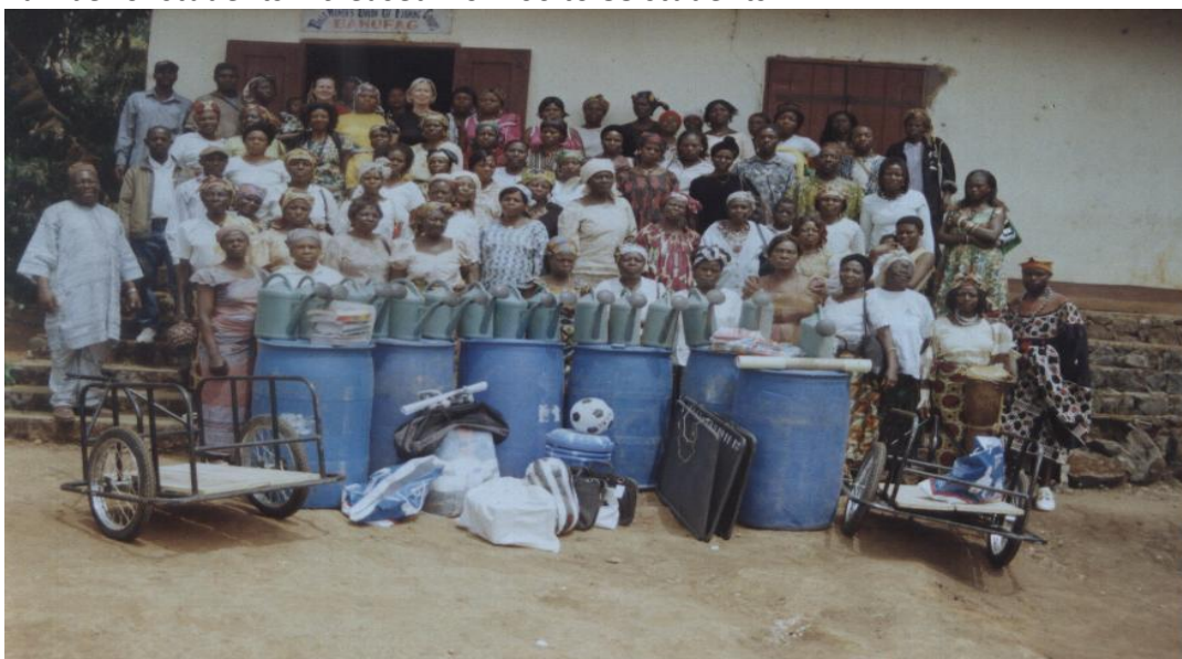
Members receive some books and equipment.

BAWUFAG has been working for the past six years to foster the human rights of women and youths with a focus on the girl child. We have had successes and obstacles but have continued to be positive in our approach to situations. Because we are operating some adult literacy centre, our program every year starts from September. This year started with the opening of the centre in September with. By the end of January we acquired some text books and writing tools for the centre and so the number of students increased from 60 to 88 students.