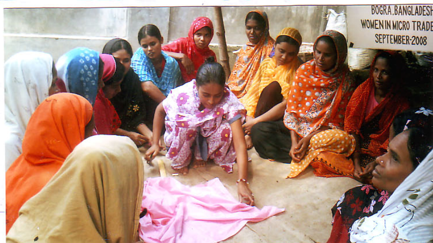
POWER's master-tailor provides practical training to slum-women at Bogra town the technique of cloth-cutting by scissor.