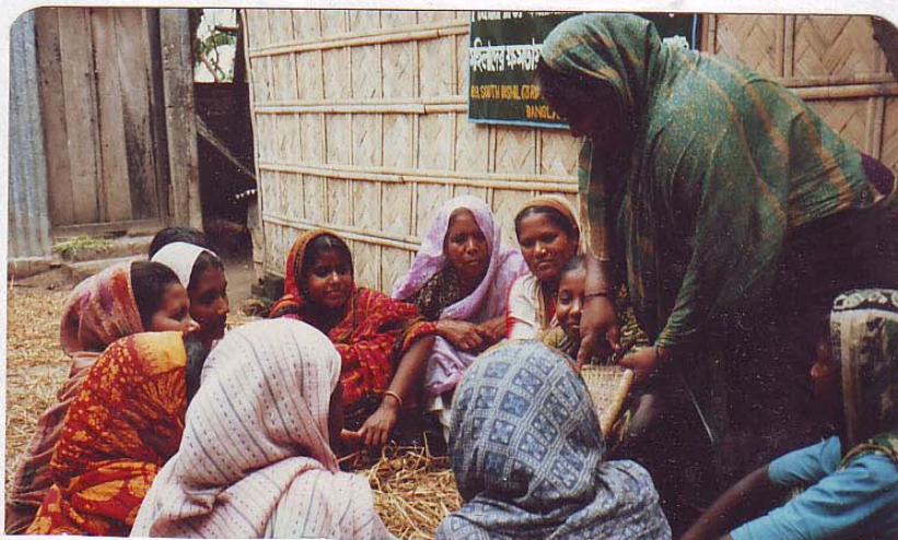
POWER's women-members are given practical trainings on production of bamboo and cane goods for income-generation