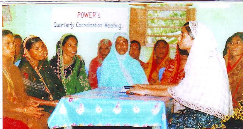
POWER management leaders' quarterly coordination meeting with educant slum-women's representatives (27-07-08)