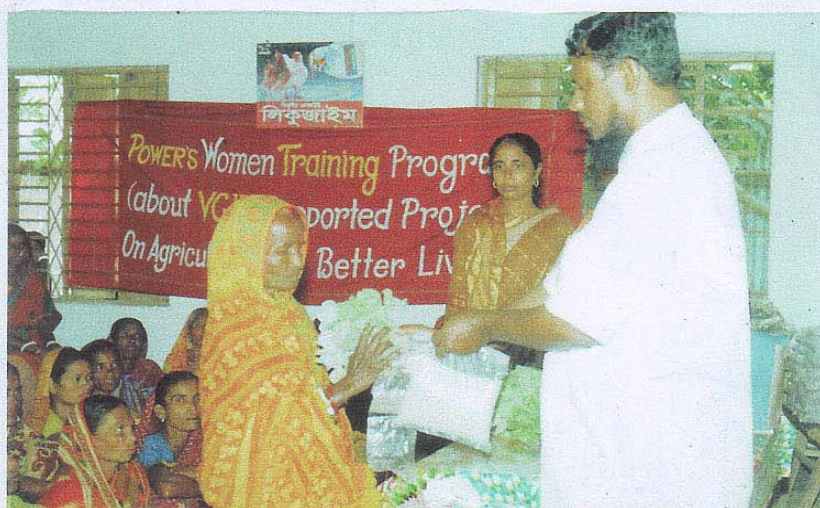
At the end of 5-day training, a trainer disburses seeds among the trainee -women