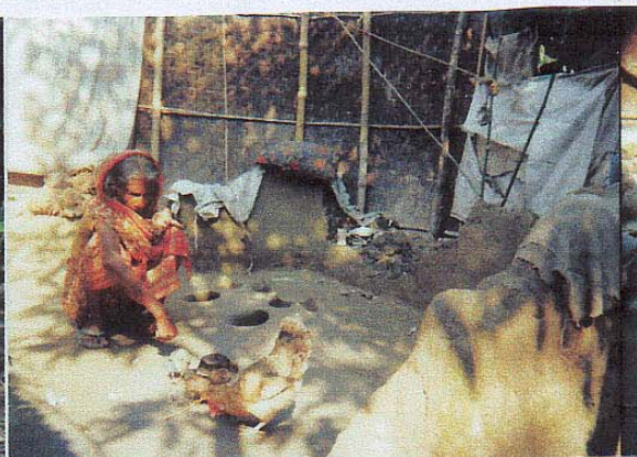
Poultry birds are reared by a woman of VGIF supported project