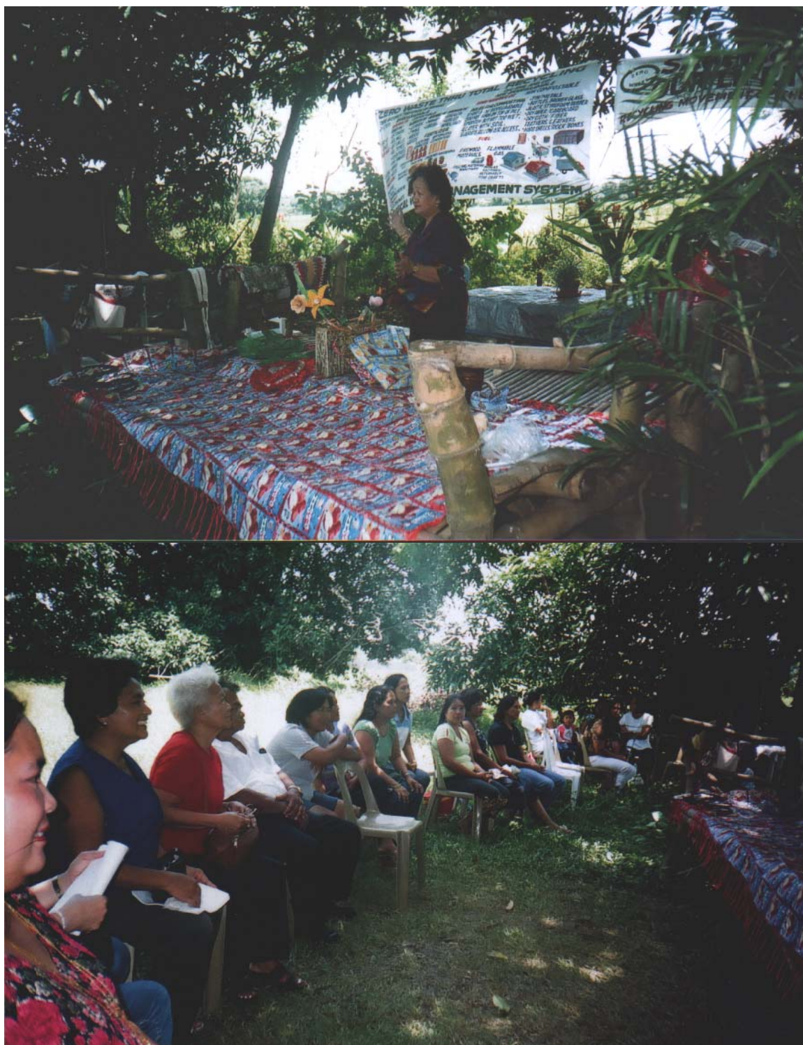
WRMP Symposium on Zero Waste Management and Recycling at Bayambang Pangasinan attended by teachers, barangay leaders and abandoned parents.