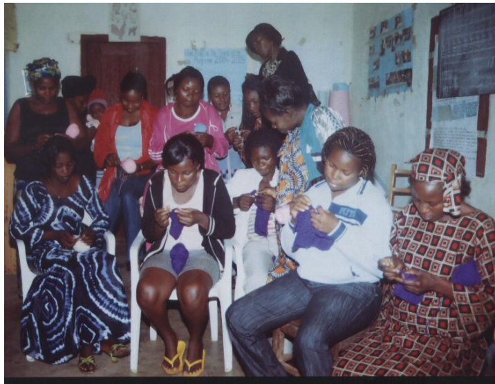
The girls during embroidery lessons

Presently, we are operating three adult literacy centers; one in Bali center, another in Mantum and another in Nzah.