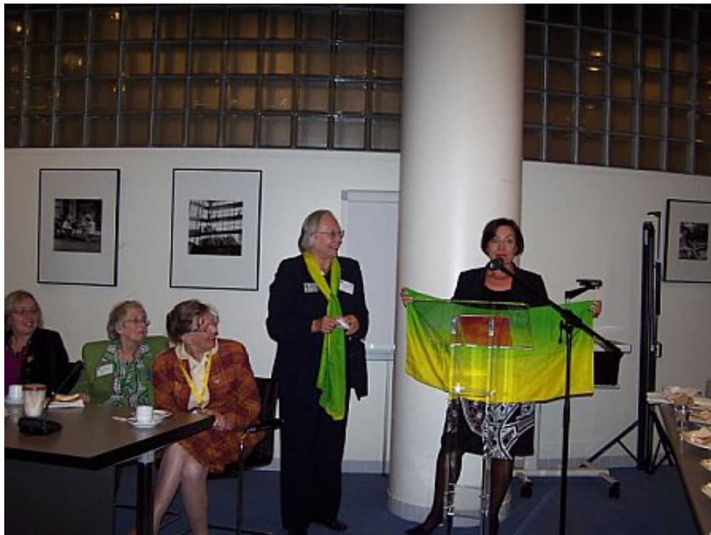
Visit to IAW archives in Amsterdam during Board Meeting 2009