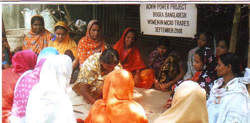
Operation of sewing machine is taught through demonstration by POWER's trainer to educant slum-women at Bogra