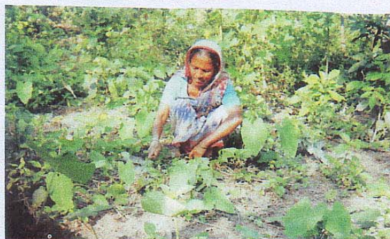
A woman-beneficiary of VGIF-funded project is taking care of her vegetable garden