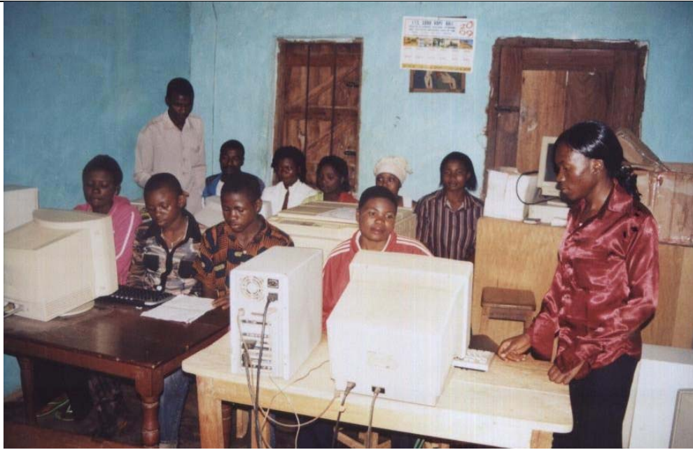
Youths in taking computer lessons

Presently, we are operating three adult literacy centers; one in Bali center, another in Mantum and another in Nzah.