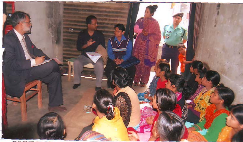
POWER's Secretary and Project Director are talking with the teacher during visit to the nonformal education NFE centre at Bogra