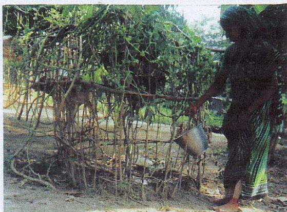
A woman of VGIF-funded project is watering vegetable plants in her garden