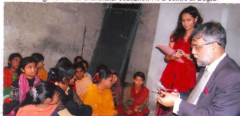
During inspection of a training centre POWER's Secretary shows the trainee-girls the methods of cutting clothes by a scissor for tailoring