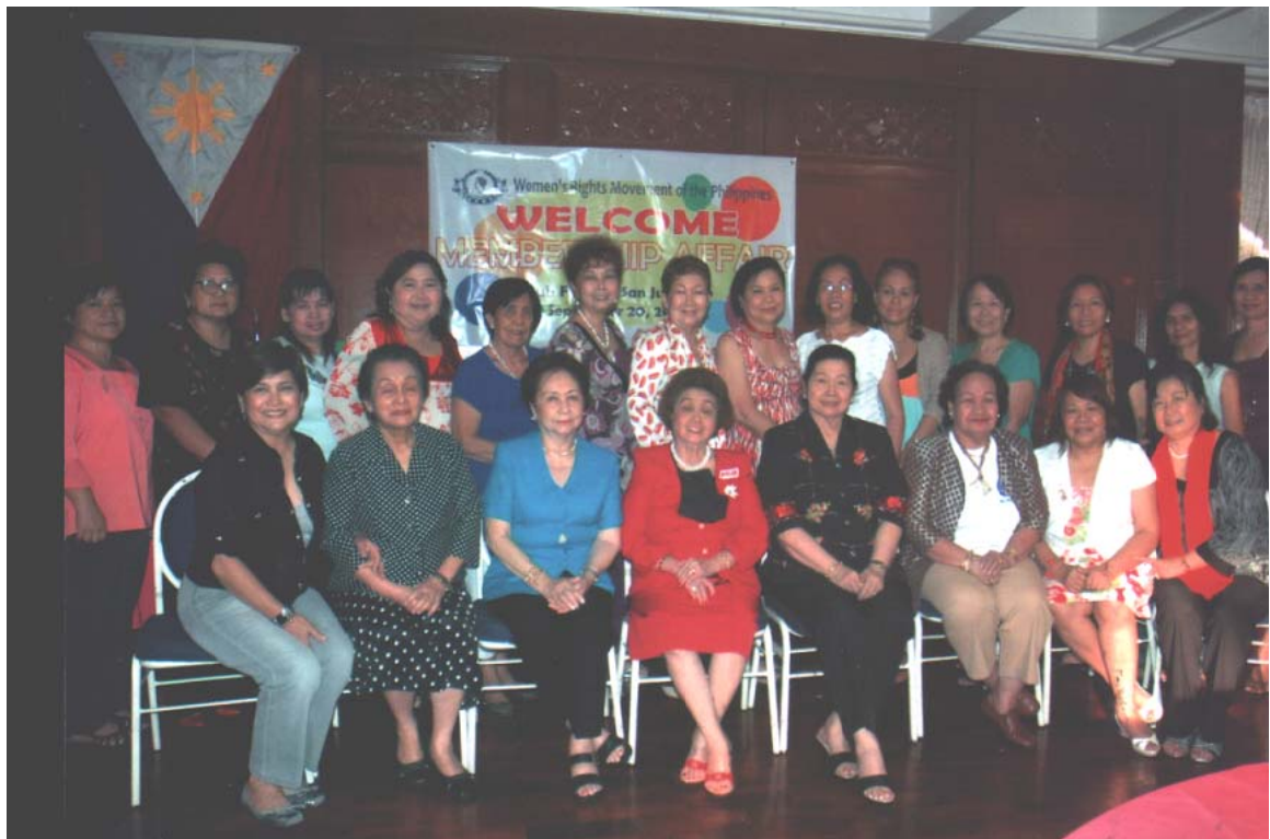
WRMP Membership Campaign