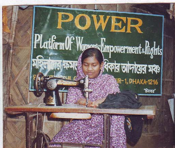
An oppressed women on getting training and loan from POWER runs sewing for livelihood