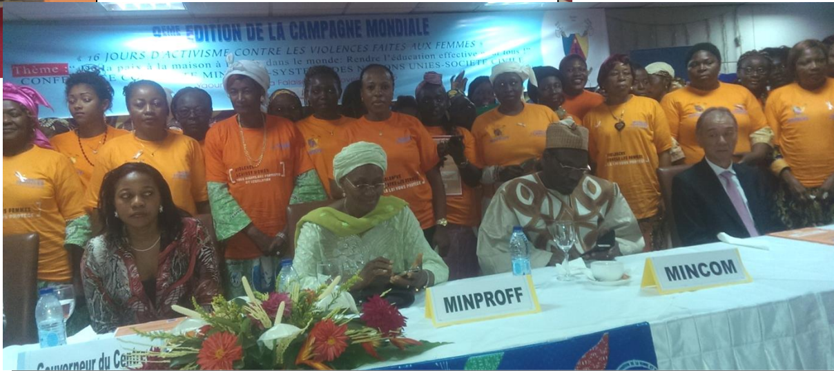
Civil society Organizations mobilized and committed to end violence against women and girls and to teach a culture of peace and non violence within our families in local communities Here, with the Minister of Women's empowerment, the Minister of Communication and the others authorities