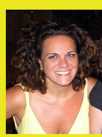
reelance Graphic Designer/Illustrator specialising in advertising material books magazines and packaging