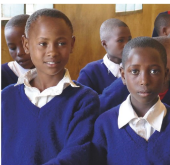
Devenir femme en toute sérénité Un projet de l'Alliance Internationale des Femmes IAW/AIF