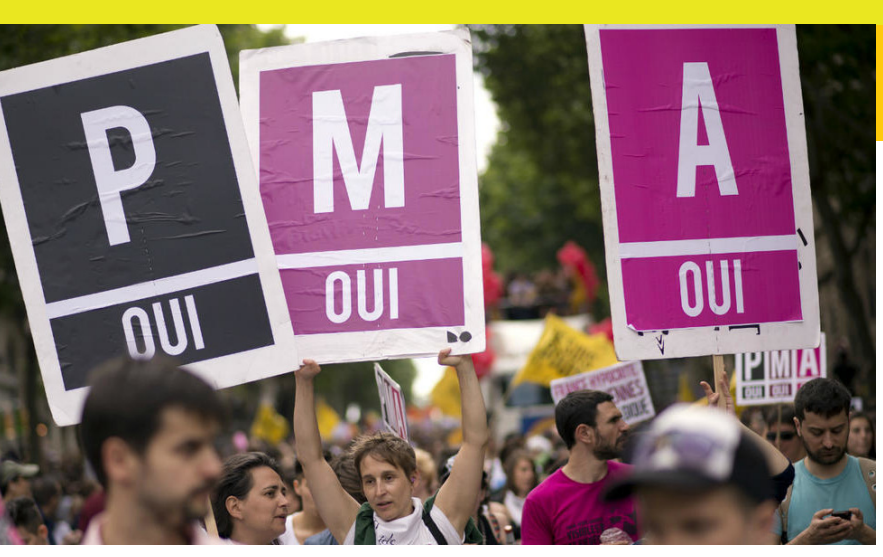
June 29 2013 in Paris

compiled by Jessica Orban, Holly Herbert and Lea Börgerding