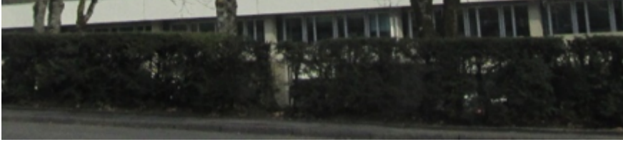
WHO from the outside