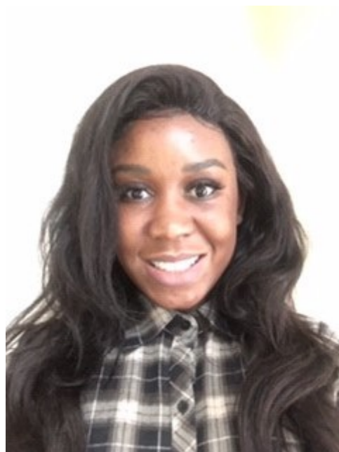
Elected Board Members